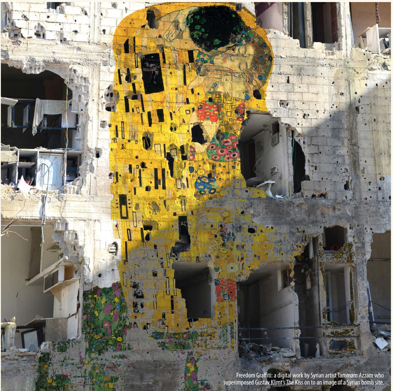
Freedom Graffiti: a digital work by Syrian artist Tammam Azzam who superimposed Gustav Klimt's The Kiss on to an image of a Syrian bomb site.