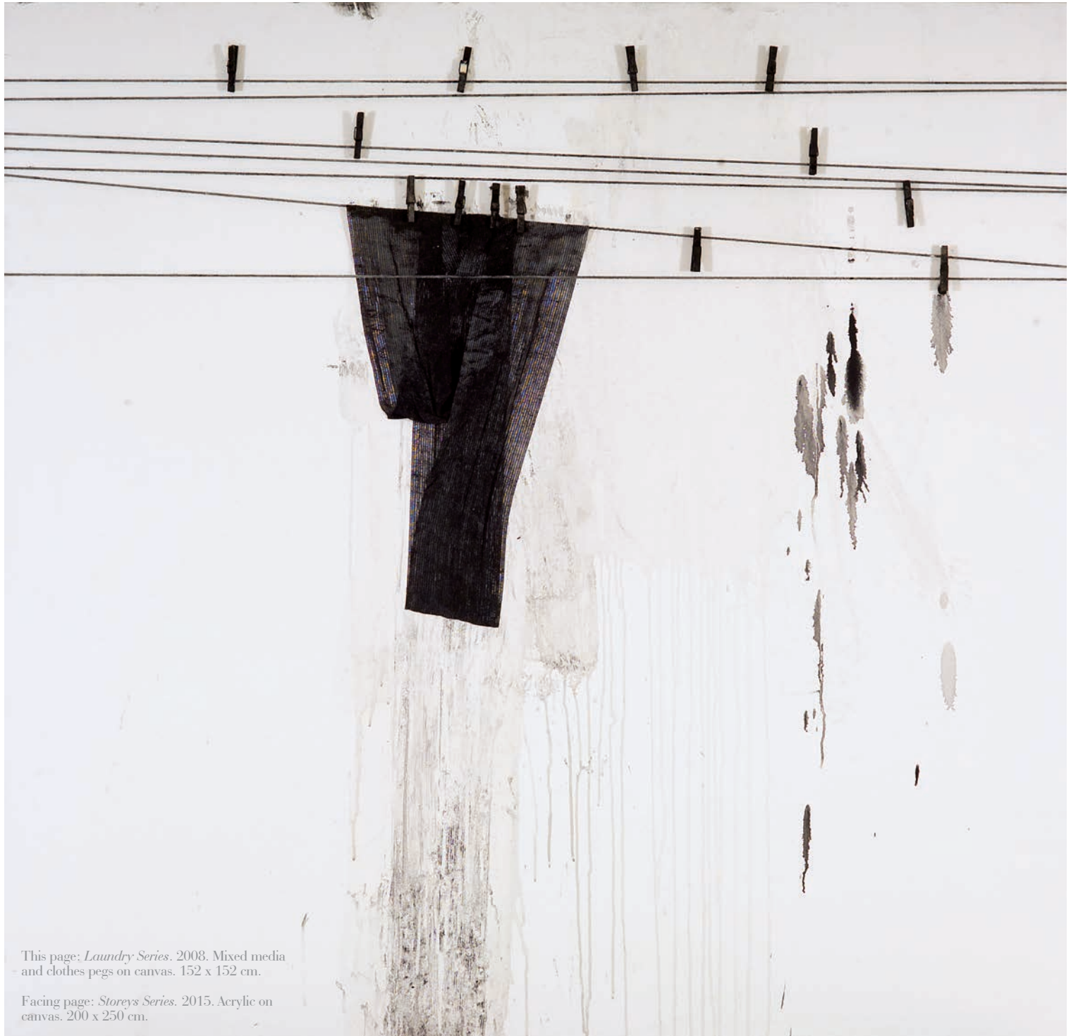
This page: Laundry Series . 2008. Mixed media and clothes pegs on canvas. 152 x 152 cm.